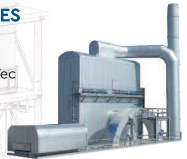
Full ring dryer by VetterTec

VetterTec ring and flash dryers are employed for a wide range of applications by adjustment of the wet feed system, dryer inlet/outlet temperatures, internal and external product recycle and product collection system.